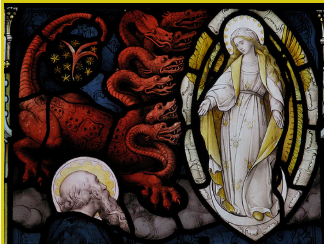
John's Heavenly Vision of Christmas from Revelation 12

Grace Evangelical Lutheran Church December 21, 2014